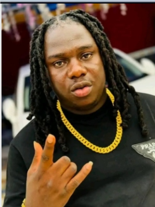
Dibia: Akwa - Okuko